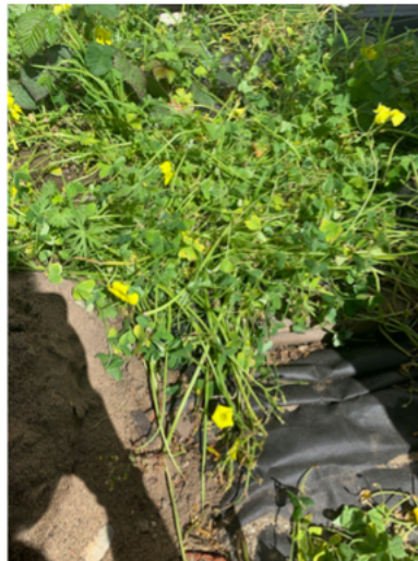
sourgrass in backyard