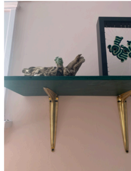
small cactus plant in driftwood.