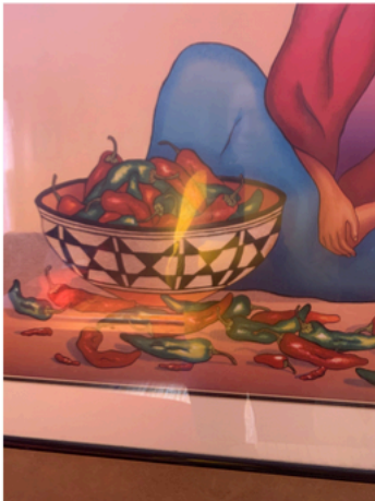
Chilli peppers in a painting

If you don't have access to a camera, describe four to eight items on a piece of paper.